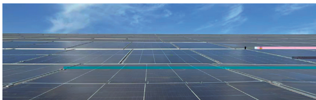
Figure 1: Project Picture